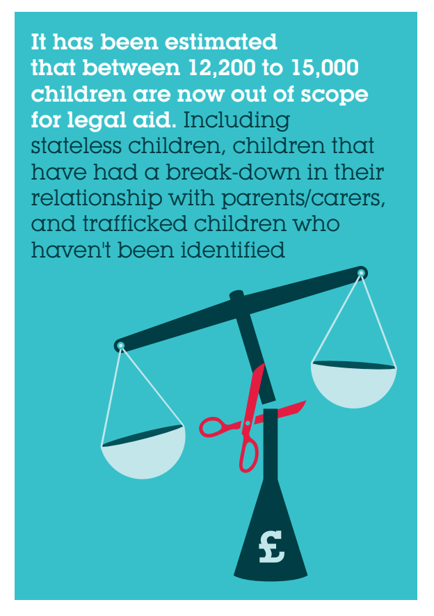
Source: The Children's Society and University of Bedfordshire (2017) An update to cut off from justice: The impact of excluding separated migrant children from legal aid

A recent report concludes that the changes, which mean all non-asylum immigration claims fall out of scope for legal aid, have been: 'particularly pernicious for unaccompanied and separated children, who are some of the most vulnerable young people in our society.'9 It also highlights that most free services to help children with their immigration status are concentrated in London and the South East, and that overall such services have reduced by 50% in four years.